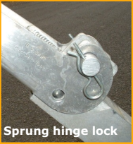
Sprung hinge lock